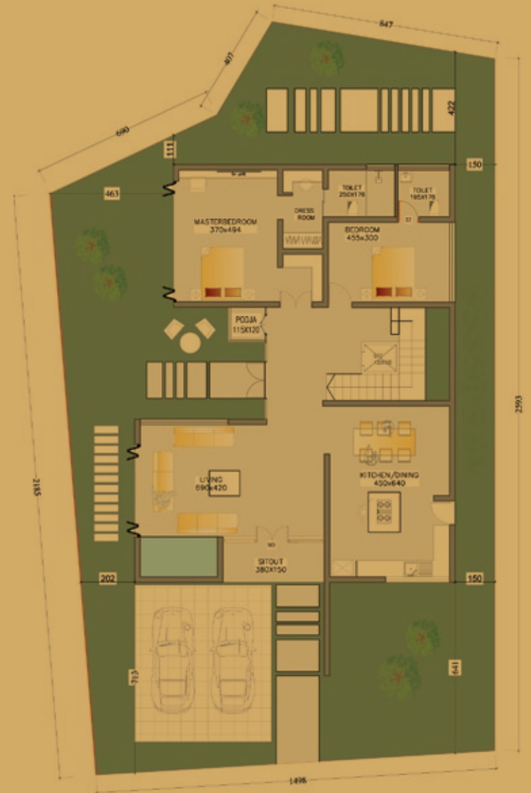
GROUND FLOOR PLINTH AREA = 161.23 SQ.M.( 1756 SQ.FT.)